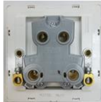
Product back view